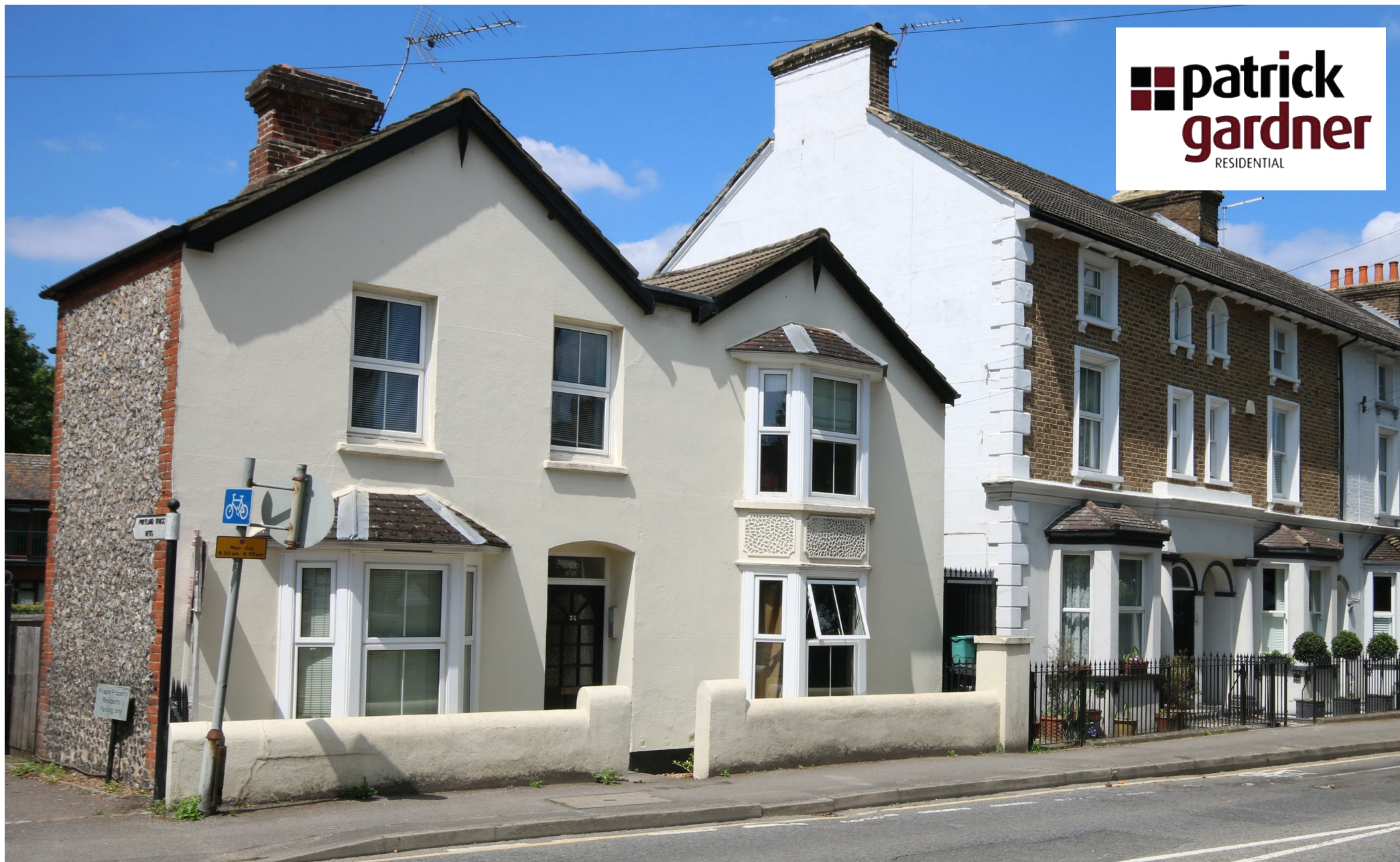
Tudor, Flat 3 32 Ashley Road, Epsom, Surrey, KT18 5BB